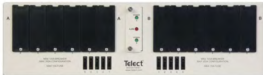
350CB06 Front View

Note: Panel ships without circuit breakers or fuses. Circuit breakers, or TFD holders and fuses must be ordered separately. See page 2 for ordering information. TFD fuse holder is CSI TFD-011 with internal schematic "C", and supports TPS and TLS fuses. The panel also supports GMT fuses.